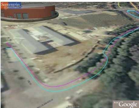
satellites, resulting in improved availability,

Signal blocking by buildings, trees, mountains and other obstructions provide limitations to applicability of GNSS in the most challenging professional applications requiring high-precision position data. Besides tracking GPS and GLONASS